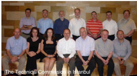
The Technical Commission in Istanbul

In June the most recent meeting of the Technical Commission took place in Istanbul/Turkey. The member company Gentas had invited the Commission to visit the Gentas melamine production and to hold its meeting in Istanbul.